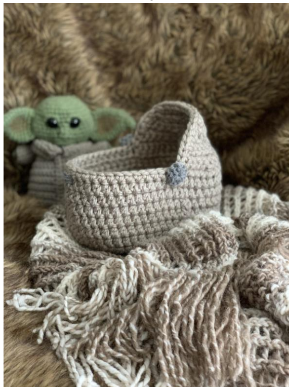
A fun accessory for Baby Yoda